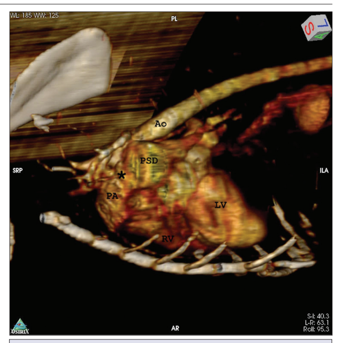
Fig 3. 3D-CTA showed the pulmonic stenosis (asterix) and post-stenotic dilation (PSD) of pulmonary artery (PA). Ao: Aorta, LV: Left ventricle, RV: Right ventricle

medication. The possible mechanism of the non-clinical signs in this dog is that PS could be prevent left heart failure caused by VSD <sup>[3]</sup>. In dogs with clinical symptoms and having a cardiac remodelling due to PS, medical support such as pimobendan, sildenafil or bosentan is used to reduce PA hypertension <sup>[1,5]</sup>. In severe cases of PS, balloon valvuloplasty is performed as well. Dogs with mild VSD should be monitored without medication if the patients do not show the clinical signs because it could be closed spontaneously in time. If not, VSD can cause left heart failure, and then classical drug therapy should be initiated. VSD could be improved by surgical approaches <sup>[1]</sup>.