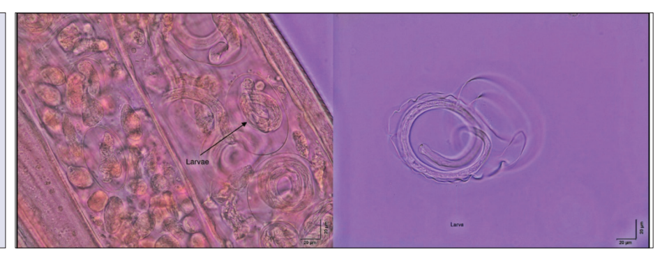
Fig 3. Larvae ( left ) in the distal uterus and external larvae of T. callipaeda (right) (x40)

In the parasite's uterus, grown larvae and larvae in the development phase were observed ( Fig. 3, left ). The eggshell in the sheath style was determined outside of the freed larvae ( Fig. 3, right ).