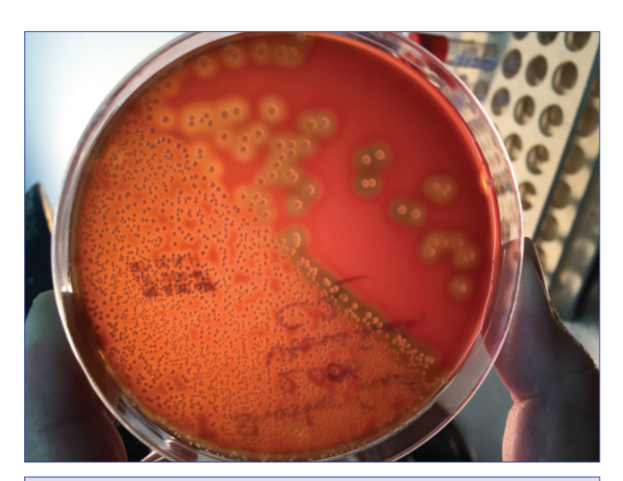
Fig 2. Beta hemolytic Streptococci colonies on 5% sheep blood agar. The isolated colonies in the picture were identified as Streptococcus equi subsp. equi

The statistical analysis of the association between age groups (including ≤2 years old and 3≤ years old) and the amount multidrug resistant isolates were evaluated using