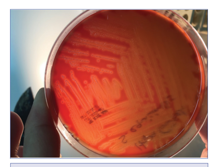
Fig 3. Streptococcus dysgalactiae subsp. equisimilis colonies isolated from endometrial swab

When the sites of isolations were examined, S. zooepidemicus (88.0%), S. equisimilis (10.9%) and S. equi (1.1%) were