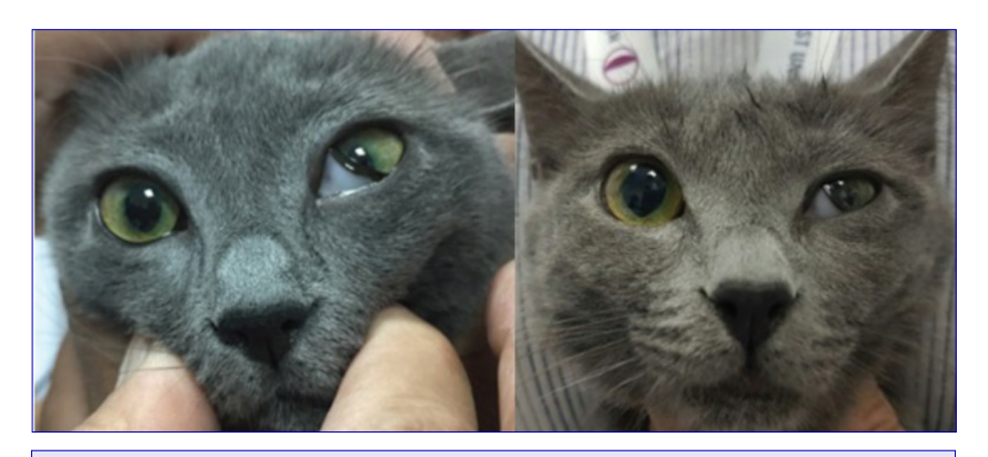
Fig 2. Post-operative Horner's syndrome in the left eye (ptosis, miosis, enophthalmos, protrusion of palpebra tertia)

HCL (2.5% Mydfrin ophthalmic solution, Alcon, 3x2 drops) was given to fix the Horner's syndrome that occurred following the traction-avulsion of the polyp (Fig. 2), while Methylprednisolone acetate (Prednol tablet, Mustafa Nevzat, 2 mg/kg/day orally for 1 month) was given to prevent relapse of the polyp. It was observed that the Horner's syndrome that developed in the 1st operative day was fixed in a period of 1 month (Fig. 3). The results of the hemogram, blood count, blood biochemistry, urine analysis, feline leukemia virus and feline immunodeficiency virus tests on the cat were in normal ranges.