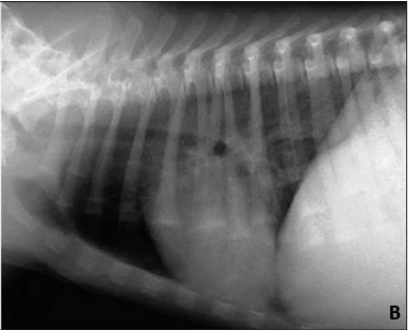
Fig 1. The lateral thoracic radiographs of the puppy. A- The yellow circle points out the localization of the olive pit in the tracheal lumen. B- Post-endoscopic control radiograph of the thorax shows the minimal bronchial pattern pulmonary influence

Şekil 1. Yavru köpeğin lateral toraks radyografisi. A- Sarı çember trakeal lumen içindeki zeytin çekirdeğinin lokalizasyonunu belirtmektedir. B- Toraksın endoskopi sonrası control radyografisi minimal bronşial desen pulmoner etkilenimi göstermektedir