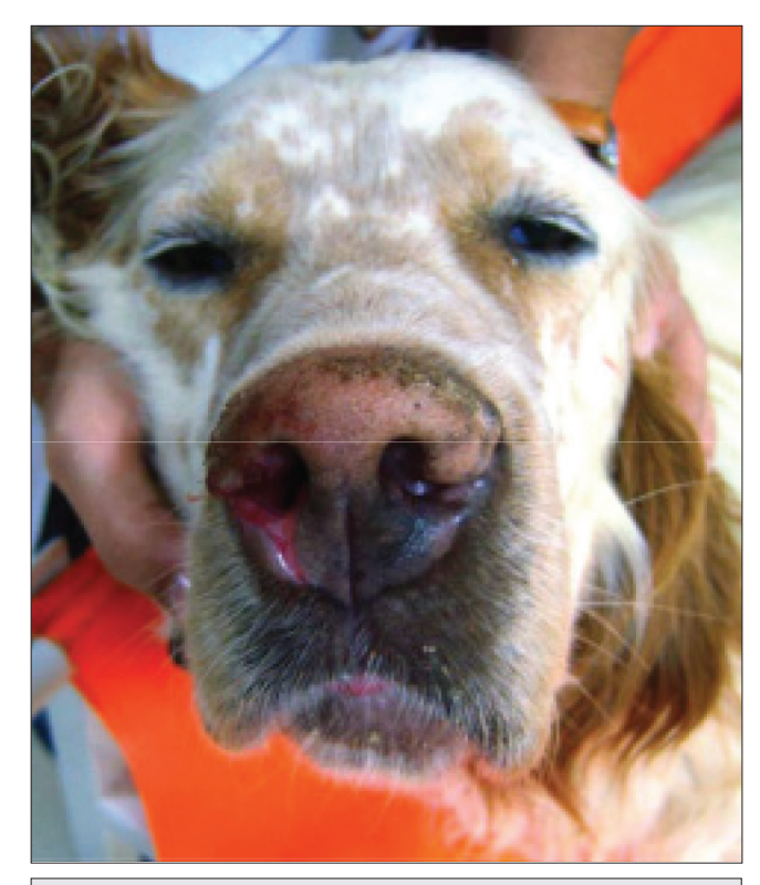
Fig 1. Lesion over the right ostium nose due to nasal discharge Şekil 1. Sağ ostium nazi çevresinde nasal akıntı nedenli şekillenmiş lezyon

ketamine HCl (Alfamine®, Egevet, Turkey) injection after 2 mg/kg/i.m., xylazine HCl (Alfazyn®, Egevet, Turkey) sedation. The dog was laid down sternoabdominal and rhinoscopic examination was performed using 2.7 mm diameter rigid telescope and additional equipment (Karl Storz®, Germany). During examination, cold lactate ringer solution was insufflated locally to provide the clear endoscopic view and to prevent the mucosal hemorrhage from the inflammative spots on mucosal layer. Lesion was determined over the right ostium nose (Fig. 1). Rhinoscopy revealed local hemorrhagic spots, congestion, mucosal polyp-like structures and erosions in the nasal cavity,