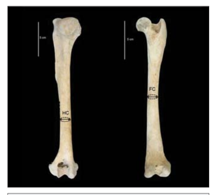
Fig 2. Long-bone measurements. Left: humerus (posterior view); right: femur (posterior view); HC - humeral circumference; FC - femoral circumference

The body weight obtained were then compared with values from contemporary canine breed <sup>[25,26]</sup>, and other mediaval <sup>[27]</sup> and Iron-Age archaelogical sites <sup>[17]</sup>. This was how we obtained data that would give an idea of the size and morphologies of the Yenikapı Byzantine dogs.