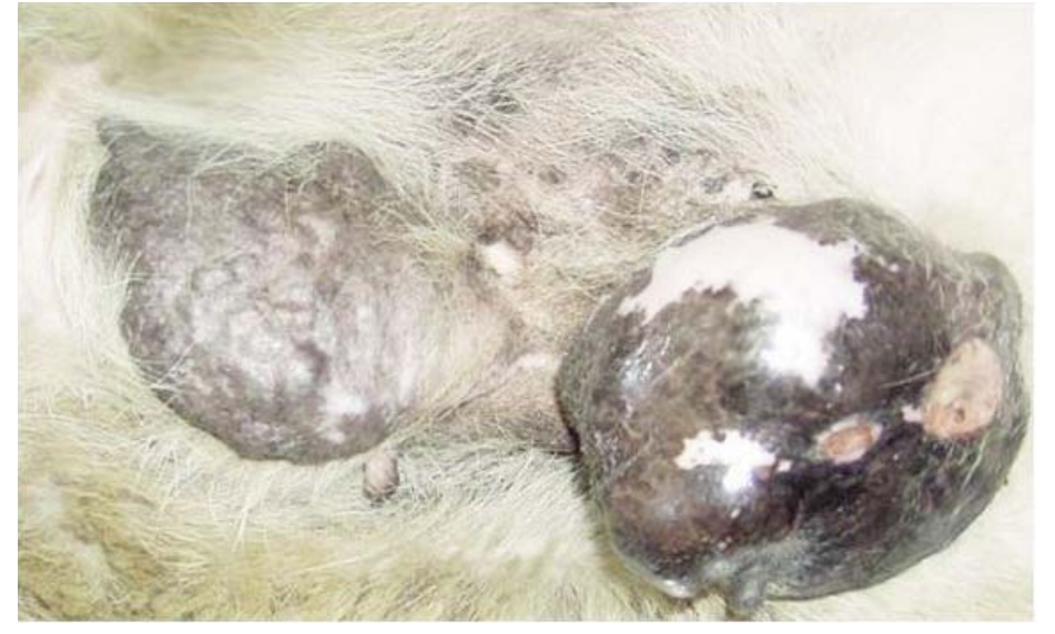
Fig 4. A macroscobic image of a complex carcinoma in a 10-years-old cross breed dog

Şekil 4. 10 yaşlı kırma ırklı bir köpeğin meme dokusunda bulunan kompleks karsinoma tanılı tümörün makroskobik görünümü