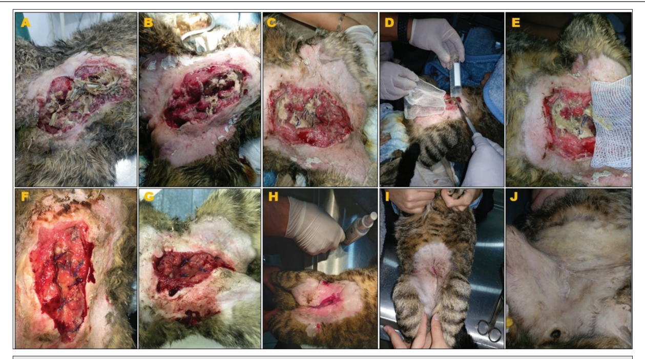
Fig 2. A: The status of the wound before MDT, B and C : The appearance of the wound after the First and second maggot application, D and E : Steps of third maggot application, F : The appearance of the wound after the third maggot application, G : The appearance of the wound after the fifth maggot application, I and J : The appearance of the wound after the fifth maggot application, I and J : The appearance of the wound area after MDT

on the wound's surface within a bio bag in the indirect contact technique [16]. Mumucuoğlu and Taylan Özkan [1] noted that the maggots within the bio bags could not thoroughly debride the necrotic tissues. Therefore, the direct contact technique was preferred considering the size of the wound and the condition of the necrotic tissues in the current case study.