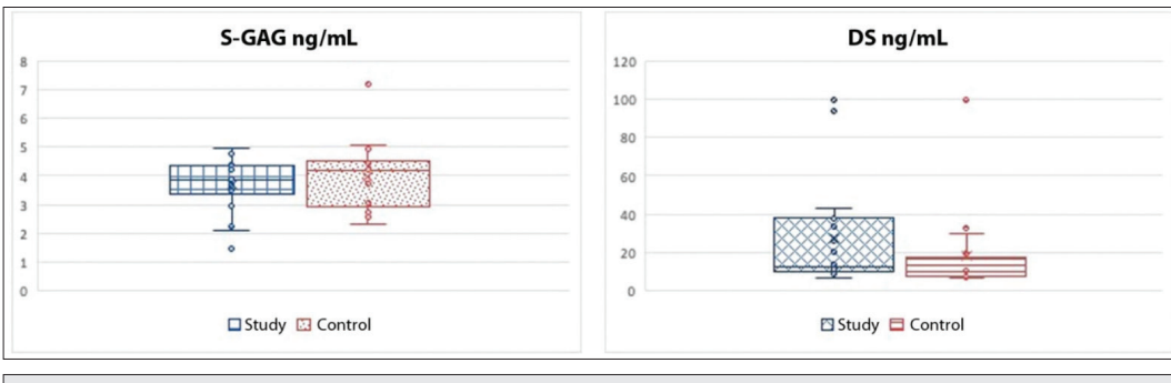
Fig 1. Box-and-whiskers plot of serum S-GAG and DS values in study (blue boxes) or control (red boxes) groups. The box incorporates the middle 50% of observation; the bottom of the box is the first quartile (25<sup>th</sup> percentile) and the top of the box is the third quartile (75<sup>th</sup> percentile). The horizontal line in the middle of the box is the median (50<sup>th</sup> percentile). The cross within each box represents the mean value. The whiskers extend to the smallest and largest observations that are 1.5 times removed from the interquartile range are plotted separately as dots

sWBC: White Blood Cells in the high-power field, sRBC: Red Blood Cells in the high-power field, sTE: Transitional epithels in the high-power field, sRE: Renal epithels in the high-power field, sST: Struvite crystals in the high-power field, sCaOXM: Ca oxalate monohydrate crystals in the high-power field