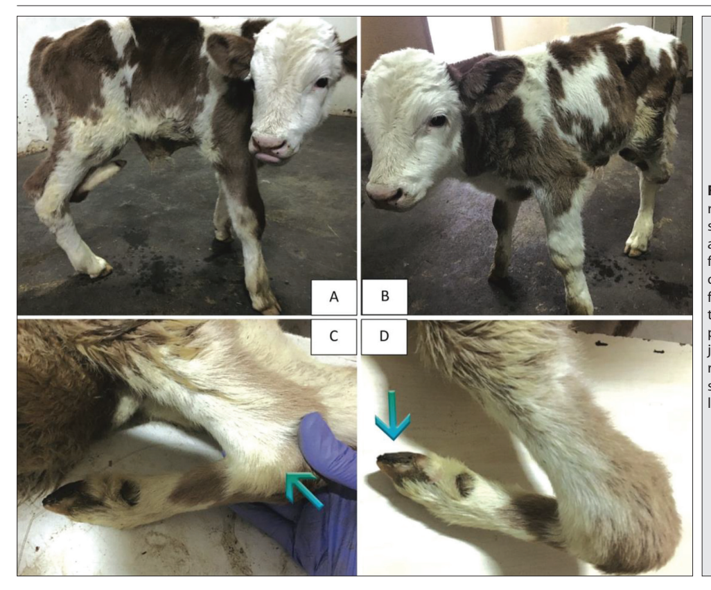
Fig 1. A, B: View of the patient from right and left side with the animal standing; The animal can easily stand and walk on three limbs; C: Excessive flexural deformity and appearance of torsioned joint (arrow). The front face of the limb is at the back and the front of the back is at the distal part of the distal part of the tarsal joint (there is approximately 180° rotation); D: In the rotated limb, the solea part of the 3rd phalanx was located dorsally (arrow)