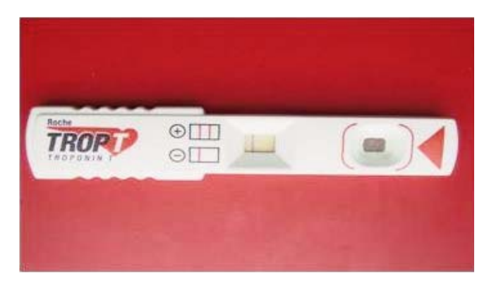
Fig 2. Negative result of cardiac troponin-T Şekil 2. Kardiyak Troponin-T'ye ait negatif sonuçları