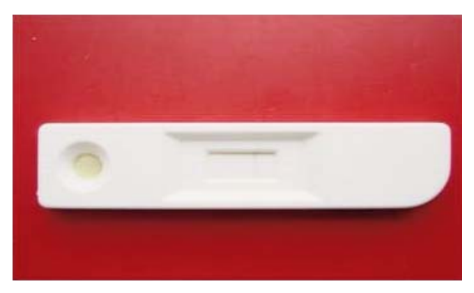
Fig 1. Negative result of cardiac troponin-I. Şekil 1. Kardiyak Troponin-I'ya ait negatif sonuçları

All rabbits in all groups revealed negative results for cTn-I and cTn-T test ( Figure 1 and 2 ).