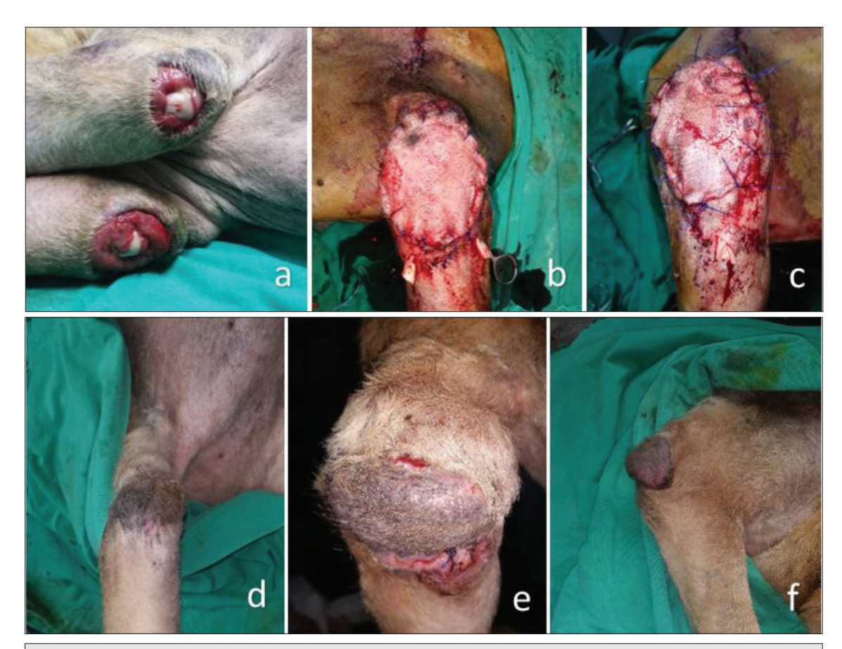
Fig 2. Pre-operative appearance of defect in both caudal elbow regions in case no.13, a ; immediate post-operative appearance of right elbow region, b ; immediate post-operative appearance of left elbow region, c ; post-operative day 10 appearance of left elbow region. Sutures in the distal part of the flap have opened and flap ends curled medially, e ; post-operative day 20 appearance of right elbow region, f

Şekil 2. Onüç numaralı olgunun her iki kaudal dirsek bölgesindeki defektin preoperatif görüntüsü, a; sağ dirsek bölgesinin akut postoperatif görüntüsü, c; sol dirsek bölgesinin postoperatif 10. gün görüntüsü, d; sağ dirsek bölgesinin postoperatif 10. gün görüntüsü. Flebin distal kısmındaki dikişler açılmış ve flebin uçları mediale doğru kıvrılmış, e; sağ dirsek bölgesinin 20. gün postoperatif görüntüsü, f