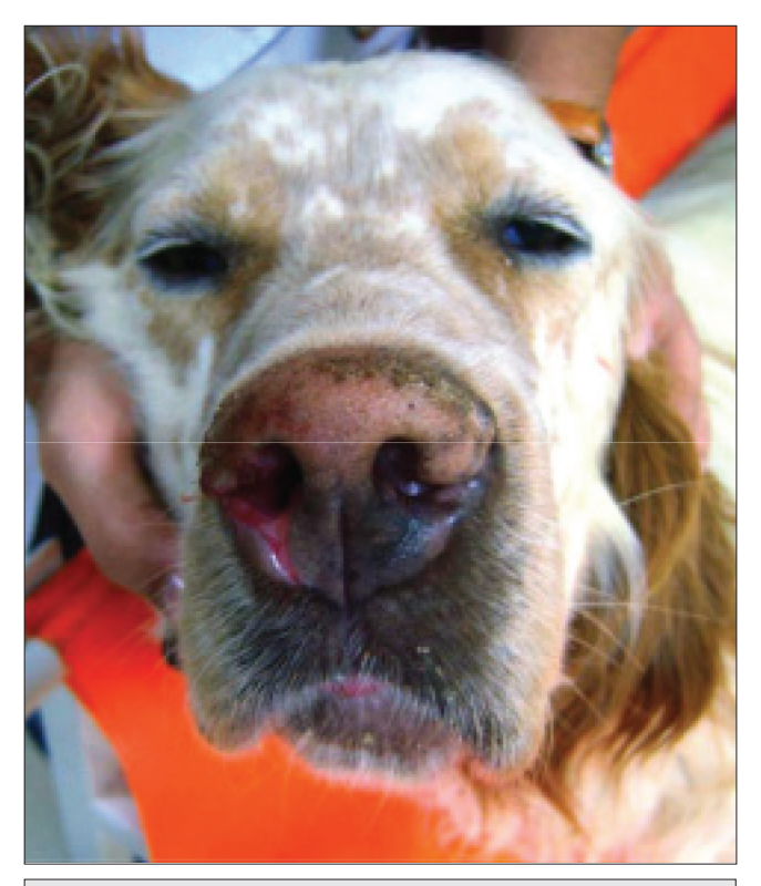
Fig 1. Lesion over the right ostium nose due to nasal discharge Şekil 1. Sağ ostium nazi çevresinde nasal akıntı nedenli şekillenmiş lezyon

ketamine HCI (Alfamine®, Egevet, Turkey) injection after 2 mg/kg/i.m., xylazine HCI (Alfazyn®, Egevet, Turkey) sedation. The dog was laid down sternoabdominal and rhinoscopic examination was performed using 2.7 mm diameter rigid telescope and additional equipment (Karl Storz®, Germany). During examination, cold lactate ringer solution was insufflated locally to provide the clear endoscopic view and to prevent the mucosal hemorrhage from the inflammative spots on mucosal layer. Lesion was determined over the right ostium nose (Fig. 1). Rhinoscopy revealed local hemorrhagic spots, congestion, mucosal polyp-like structures and erosions in the nasal cavity,