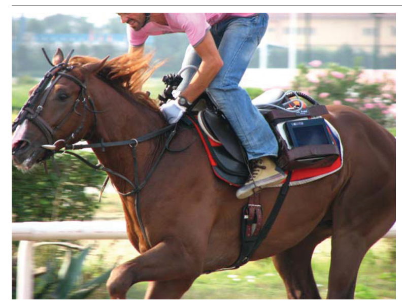
Fig 1. The horse in gallop on the race course (polytrack race course) with mobile endoscopy unit