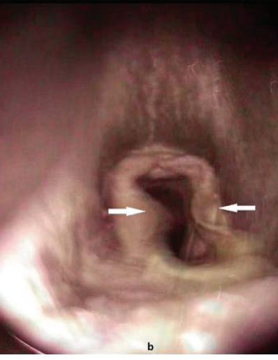
Fig 2. Normal position of the aryepiglottic folds at resting endoscopy ( a, black arrows ). Axial deviation of aryepiglottic folds at exercise with dynamic endoscopy ( b, white arrows )